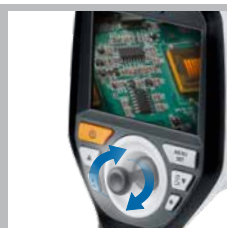
Manual 3D control